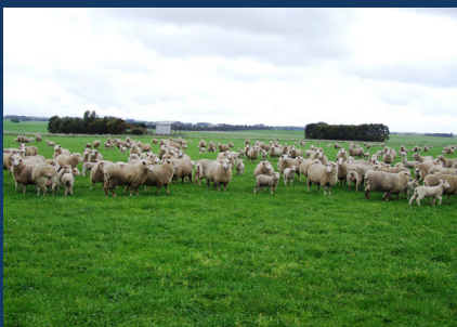
Article by James Whale

For an independent review of management practices being used within your own business to maximise reproduction please contact the Yendon office on 03 5341 6100.